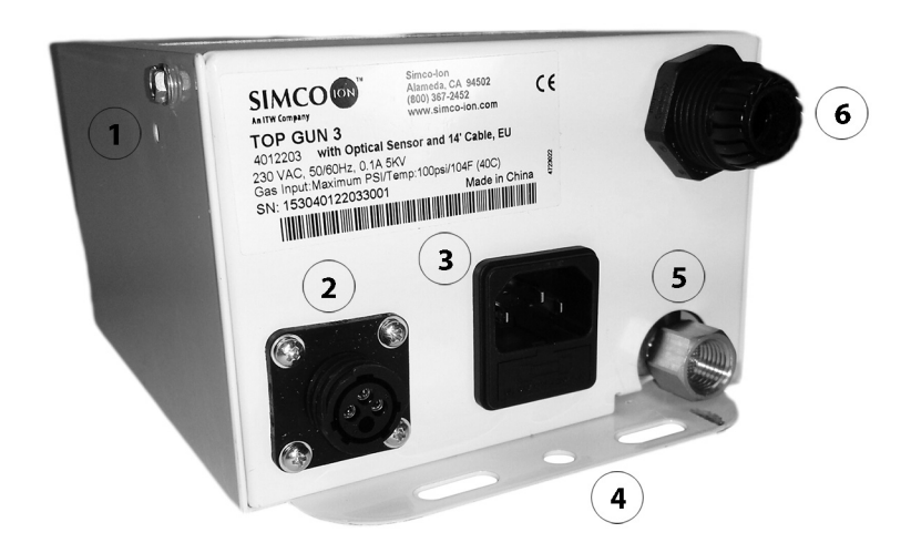
Figure 3. Top Gun Power Unit

Top Gun can use clean dry compressed air, nitrogen or carbon dioxide at pressures up to 100 psi. Compressed gas is connected to a power unit that contains a solenoid to turn gas flow on and off. High quality polyurethane tubing conducts the gas to the gun. At the gun, flow is controlled from a whisper to a blast by an integral needle valve using the gun control knob. The compressed gas is filtered just prior to leaving the gun in an integrated, replaceable filternozzle. The nozzle has been carefully designed to yield a forceful blast while providing the lowest possible noise levels.