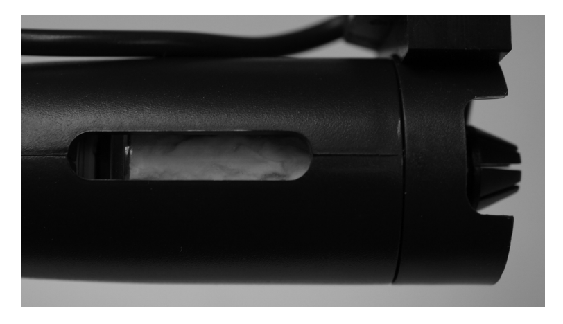
Figure 7. Top Gun Replacement Filter

The compressed air filter uses a special filter media that changes color as contaminants are trapped. When the filter media changes to a red color or air flow is restricted, filter-nozzle replacement is indicated.