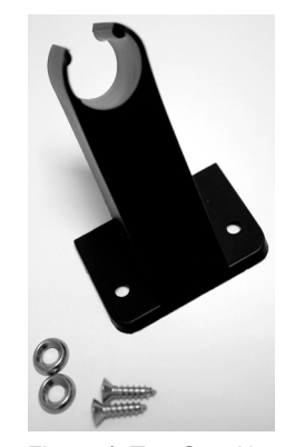
Figure 4. Top Gun Air Gun Hanger

The gun hanger can be mounted on any convenient surface such as a wall, side of a table top or work bench leg. The hanger can also be mounted on the front of the power unit using the pre-punched holes. Secure hanger with screws and washers: