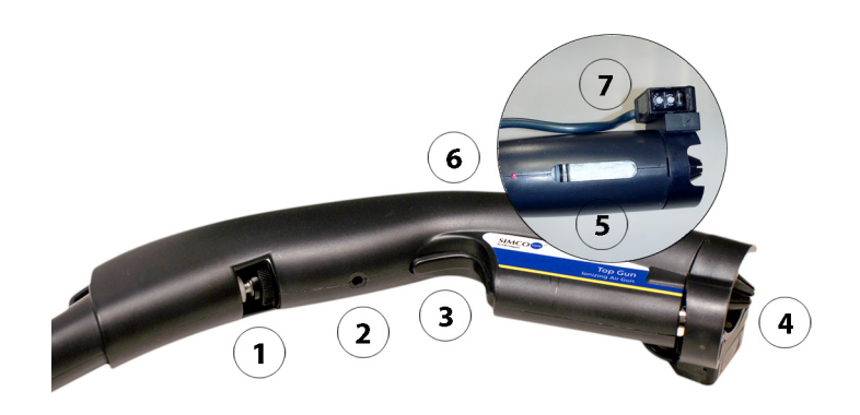
Figure 2. Top Gun Air Gun

Simco-lon's Top Gun is an ionizing air gun that produces an intense air flow rich in both positive and negative air ions. Directing the air flow on an item that has a static electricity charge will neutralize the charge and clean the item. It is ideal for cleaning items that have developed a static charge due to handling or fabricating processes. If the item has a negative static charge, it will draw positive ions from the air flow. If the item has a positive static charge, it will draw negative ions from the air flow. The air ions are attracted to the oppositely charged item thereby neutralizing the static charge on the item.