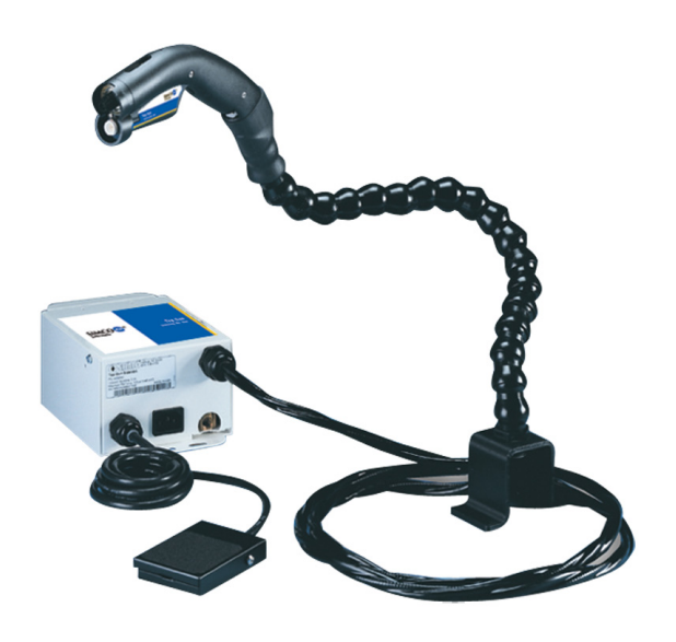
Figure 5. Top Gun Ionizing Air Gun with Sidekick

If you ordered your Top Gun with Sidekick, then you have also received the flexible semi-rigid neck stand we call Sidekick along with a footswitch.