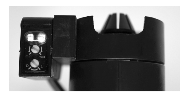
Figure 6. Top Gun with Optical Sensor

Plug the sensor cable into the power unit (if not already done so out of the shipping carton). To use the Optical Sensor, simply pass or hold an object to be ionized in front of Top Gun. Top Gun (orange LED is lit) will trigger and stay on until the object is removed from in front of the sensor. The green LED is lit when the optical sensor is on. The lower dial should be set to the "L" position (on the Light reflection). This triggers Top Gun when an object passes in front of the sensor. If the lower dial is set to the "D" position (for Dark), then the sensor will trigger Top Gun (orange LED is lit) if the object is removed in front of the nozzle. If desired, the top dial may be adjusted to change the sensitivity of the sensor (min to max).